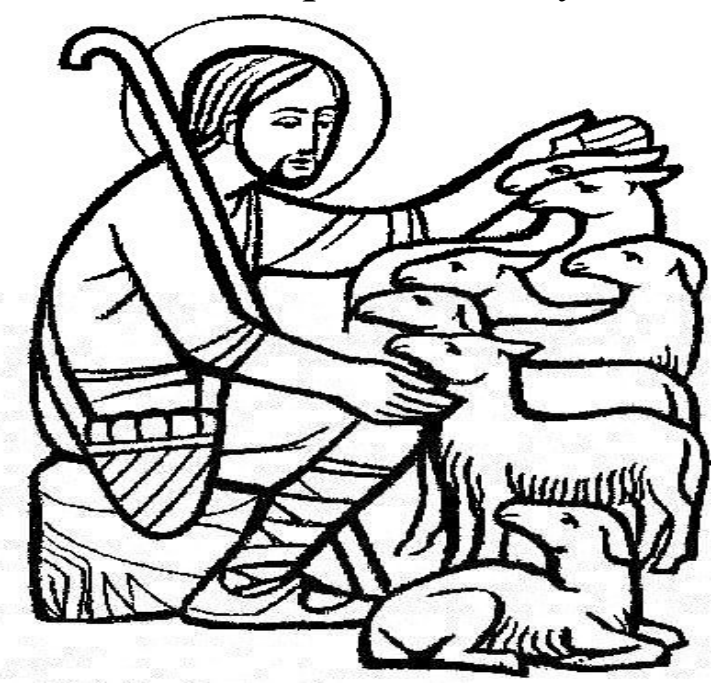
The Lamb will be our Shepherd